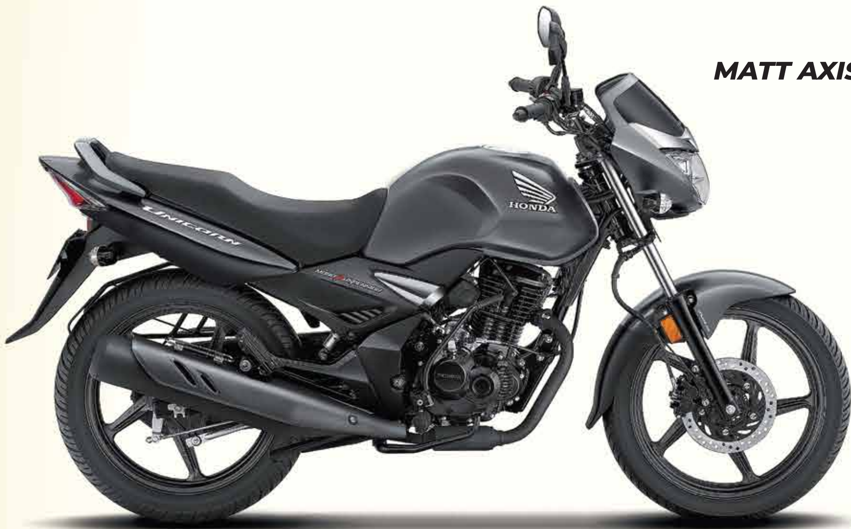
MATT AXIS GREY METALLIC